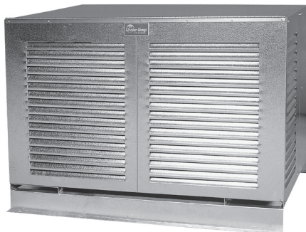
Condensing unit shown with protective cover

» PLEASE REFER TO OUR GENERAL CATALOG FOR ADDITIONAL INFORMATION AND SPECIFICATIONS ON ARCTIC-TEMP ICE MAKERS.